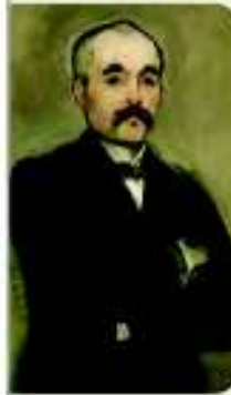
Georges Clemenceau 1841–1929

Passionate about international peace, he took on the U.S. Senate after it vowed to reject the Treaty of Versailles. During the political battle, he suffered a stroke that disabled him for the rest of his term.