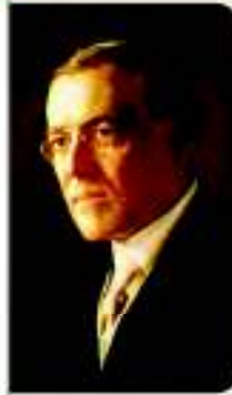
Woodrow Wilson 1856–1924

Wilson was tall and thin and often in poor health. He suffered from terrible indigestion and sometimes had to use a stomach pump on himself. A scholarly man, Wilson once served as president of Princeton University in New Jersey.