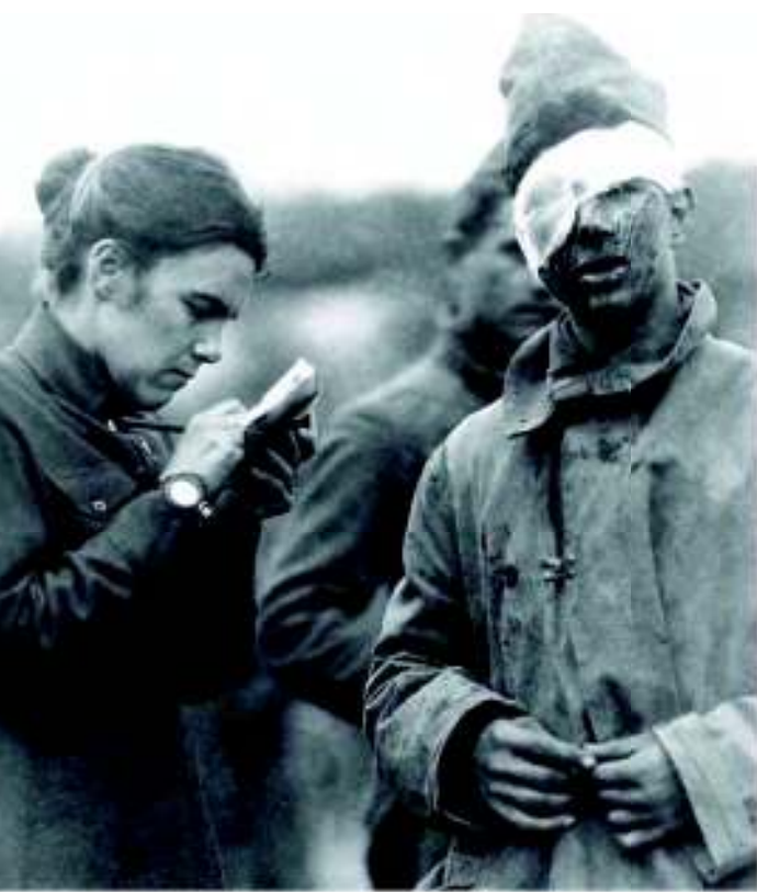
▲ A woman relief worker writes a letter home for a wounded soldier.

Numerous facilities were converted to munitions factories. Nearly every able-bodied civilian was put to work. Unemployment in many European countries all but disappeared.