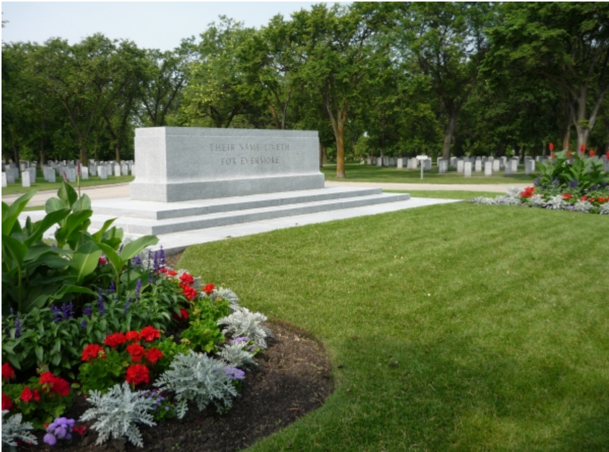
The only Stone of Remembrance in North America, at Brookside Cemetery in Winnipeg (Commonwealth War Graves Commission Canadian Agency)

Larger cemeteries, generally those with over a thousand graves (though there are exceptions such as at Brookside), also have a Stone of Remembrance, designed by Sir Edwin Lutyens. Devoid of overt religious symbolism, the Stone recalls a tomb or perhaps an altar. The gravestones themselves are of light-coloured limestone and differ only in their inscriptions. They generally feature an appropriate religious symbol, a national emblem (in Canada's case, a maple leaf) or regimental badge, the soldier's name, rank, unit, date of death and age. Relatives also had the opportunity to pay for a short epitaph or other inscription to be added.