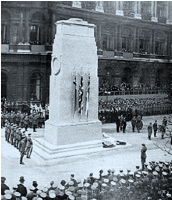
The unveiling ceremony at the Cenotaph on Whitehall, in London, 11 November 1920

For the families of those whose bodies had never been identified or found, a Tomb of the Unknown Soldier could provide a focal point for grief. The first, known as the Unknown Warrior and buried in London in 1920, was chosen from amongst six unidentified bodies collected from cemeteries in different locations in Europe; this was to ensure that the body could, in theory, be anyone's son, thus imbuing the tomb with special resonance for those who had lost a family member. (Canada's Tomb of the Unknown Soldier was established at the cenotaph in Ottawa only in 2000, and holds the body of an unidentified soldier who was killed at Vimy Ridge.)