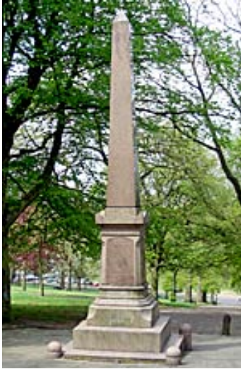
1903 Boer War Memorial, Forest Recreation Ground, Nottingham, England