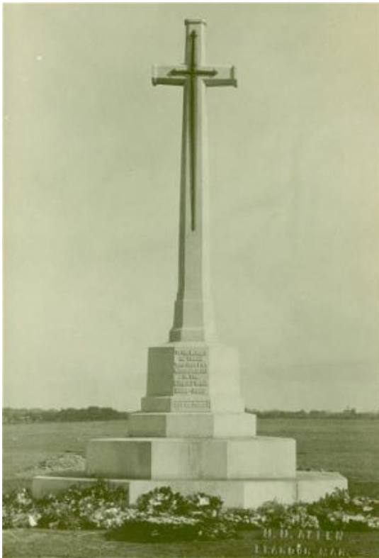
Brandon Cross of Sacrifice

War Graves Commission cemeteries are not identical, but they have certain features in common. Most have stone enclosing walls and wrought-iron gates, and all feature standard headstones. Cemeteries with more than forty graves generally have a Cross of Sacrifice as a focal point. Designed by Sir Reginald Blomfield, the Cross of Sacrifice is a granite cross with a bronze sword embedded on the front, mounted on an octagonal base. Brandon and Winnipeg's Brookside Cemeteries both have Crosses of Sacrifice.