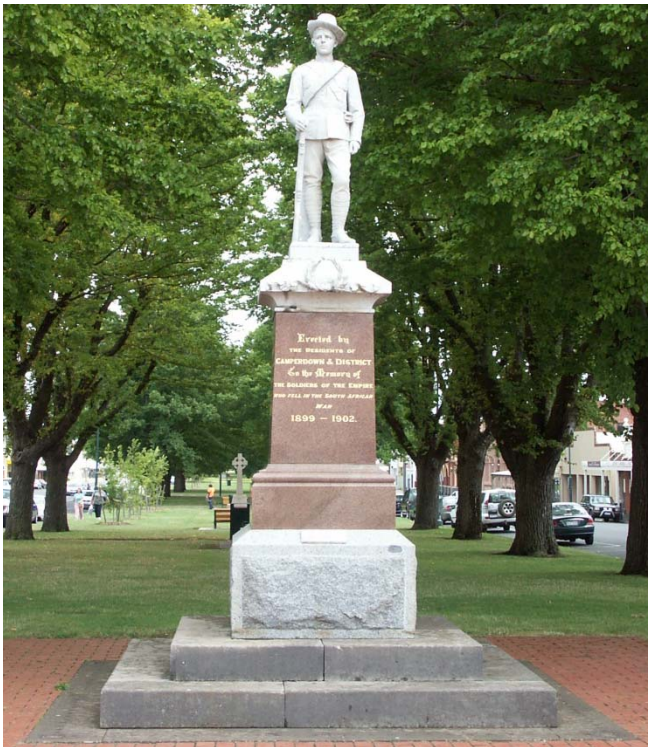
1902 Boer War Memorial (figure carved in Carrara, Italy), Camperdown, Australia

The Second Anglo-Boer War (1899-1902) saw large numbers of volunteers joining the ranks of professional soldiers in the British army. The grieving families of the dead were not happy to see their sons and husbands unceremoniously dumped into unmarked graves as in previous conflicts, their personal belongings and even teeth often removed and sold. As a result, the army, for the first time, took responsibility for both burying and recording the graves of the dead. The Royal Engineers were given this job (“Honouring the Fallen”). A volunteer group called the Guild of Loyal Women took over the responsibility for looking after graves and cemeteries, and recording grave locations. They became overwhelmed by the task, however, and burial grounds in South Africa quickly fell into disrepair.