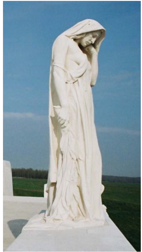
Canadian National Memorial, Vimy (1936). This memorial is dedicated to the memory of some 60 thousand dead of the Canadian Expeditionary Force. The names of over 11 thousand, missing in France, are carved in the stone. At right, a young “Mother Canada” mourns her dead.

The War Graves Commission’s decision not to allow the repatriation of bodies of men who died overseas meant that, for the majority of bereaved families, they would never see the place where their lost loved ones were buried. In addition, there were the countless soldiers who had simply disappeared in the fray – their bodies never recovered or unidentifiable. These facts gave war memorials on the home front a particularly poignant function: they stood in for the gravestones that many soldiers never had, or that their families would probably never see. The carving of names into these memorials provided a gravestone in absentia for mourning every lost soldier.