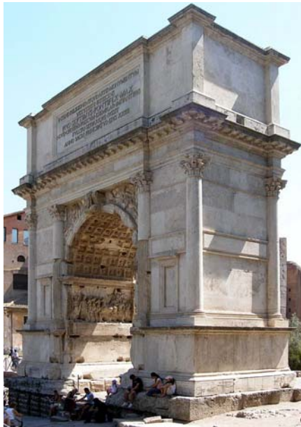
The Arch of Titus, commemorating the popular Emperor Titus and his victory in Jerusalem, has been the model for many triumphal arches since.

The war memorials familiar at first hand to Canadians are most likely those erected in the years after the end of the First World War. Their most well-known distant ancestors came from ancient Rome, and many (though by no means all) 20th-century monuments derive their basic forms from those of the ancient world. These Roman monuments were large structures, especially triumphal arches (such as the Arch of Titus, 82 AD) or victory columns (e.g. Trajan's Column, 113 AD). They had no individual memorial function, except to preserve in glory the name of an emperor or perhaps a great general, and were—as the name suggests—not about sacrifice and sorrow, but about victory. More modern descendents of such structures include familiar monuments such as the Arc de Triomphe, in Paris (1806-1836, commemorating the Revolutionary and Napoleonic Wars), and Nelson's column, in London (1840-43, commemorating Admiral Horatio Nelson, who died in the Battle of Trafalgar). Less familiar is Nelson's column in Montréal (1809). These monuments suggest, by their very names, their function of memorializing a victory and the powerful man who effected it. In Canada, Brock's Monument on Queenston Heights (1823-24; destroyed and rebuilt 1853-56) is another example of a column built to commemorate a single man, and a General. None of these structures made any pretence to commemorate the common soldier.