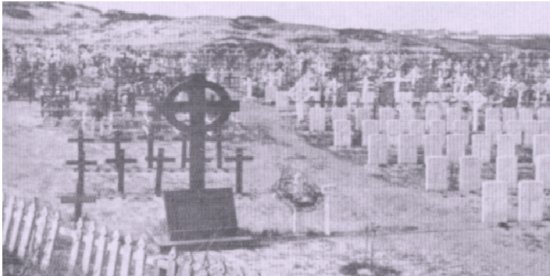
A military cemetery at Coxyde, Belgium as IWGC standard headstones (right) replace the wooden crosses of wartime burials.

As the war and the slaughter continued, Ware and his compatriots began to think about longer-term maintenance for the burial sites. They were also eager for their work to reflect the spirit of Imperial Cooperation evident in the war effort itself, and in 1917, the Imperial War Graves Commission (IWGC) was established. The membership of the Commission (renamed the Commonwealth War Graves Commission in 1960), comprised the United Kingdom, Canada, Australia, New Zealand, India and South Africa, with each country providing funding according to the number of soldiers it had lost. The Commission's work began in earnest after the Armistice, when they began identifying and registering graves, and eventually moving tens of thousands of bodies to new Imperial war cemeteries (work that still continues as bodies are unearthed in the course of agriculture or construction). For the important work of memorializing the Empire's war dead, the IWGC employed luminaries of architecture, landscape and literature: Sir Herbert Baker, Sir Reginald Blomfield and Sir Edwin Lutyens to design the monuments, with typeface designed by Max Gill; Gertrude Jekyll to oversee the landscape design, and Rudyard Kipling to choose the inscriptions. The first three experimental cemeteries were completed in 1921, with one at Forceville, France, being deemed the most successful and becoming a template for further work.