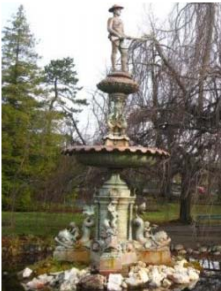
1903 Boer War Memorial, Halifax Public Gardens, NS