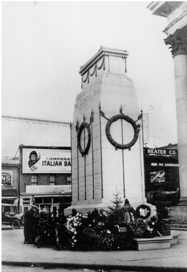
Winnipeg’s Temporary Cenotaph, with the Bank of Montréal visible at right. On the front was painted “The Glorious Dead; Their Name Liveth Forevermore”.

Winnipeg had its own temporary cenotaph, erected by the Women’s Canadian Club outside the Bank of Montréal at Portage and Main, in June 1920 ( Manitoba Free Press , Saturday 5 June 1920). It stood for about three years, and was then replaced by the Bank’s own bronze figure of a soldier, which stands there still.