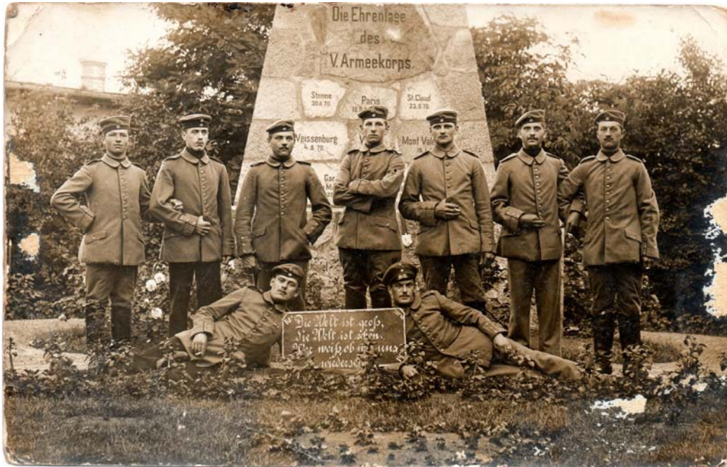
A 1914 photo showing a group standing in front of a memorial commemorating battles of the Franco-Prussian War involving the 5th Army Corps.

and communities gathered around them yearly to commemorate their losses and to remind (and perhaps convince) themselves of the glory of the sacrifice and its noble patriotic purpose.